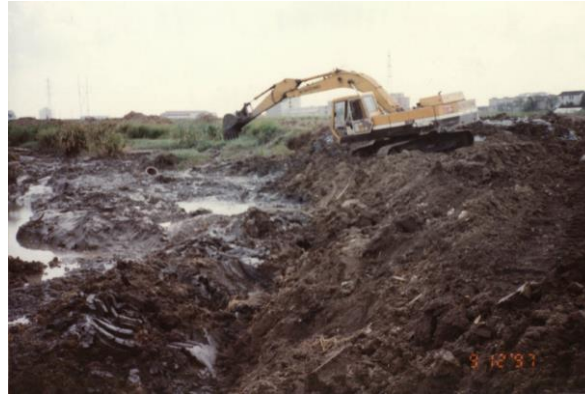
Ground breaking for the main campus in 1997