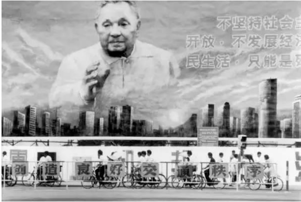
A new wave of economic development since 1992